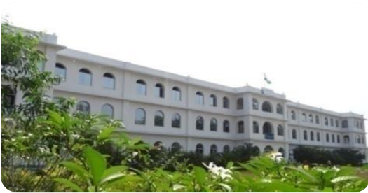
A N NIVEDITA B.ED. COLLEGE

Empowering the community through integrated education, health, and environmental initiatives, envisioning a resilient, sustainable, and harmonious future for all..