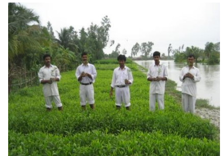
Organic Farming & Nursery