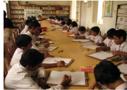
Community Library & destitute Home children