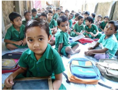
Crèche & Preprimary school Programme