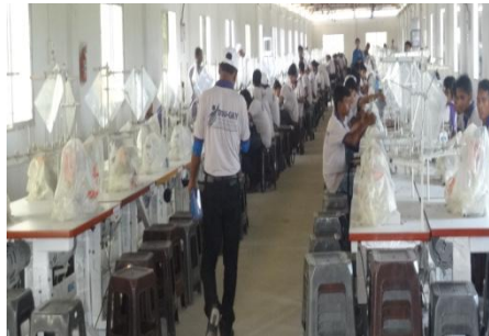
Residential Skill Training center