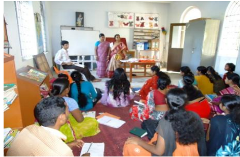
Skill Training prog for Women