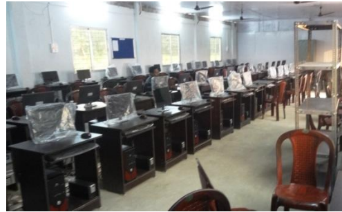
Tailoring & Computer Training