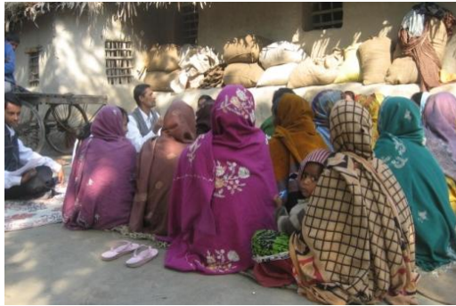
Involvement with the community mothers