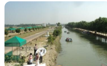
Rural Tourism & Cultural Centre