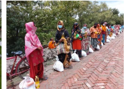
COVID-19 pandemic , Amphan & YASH relief prog.