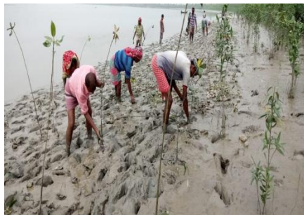
Mangrove Plantation And conservation Programme