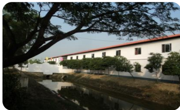
Residential Training campus

Ashok Nilay is a social developmental organization working since 2007 for the development of rural community of south 24 Pgs area through Education , Skill Dev, Social relief, Health and Environmental developmental programmes , such as Pre primary & Junior high School , technical and vocational Colleges, Library, Skill training center, Health center, Social forestry prog , Agri based - Rural tourism & Cultural center etc..`, for the underprivileged communities for job creation and employment generation!