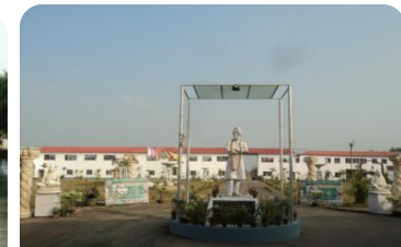
Nursing Campus (proposed)