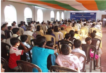
Renewable Energy centre