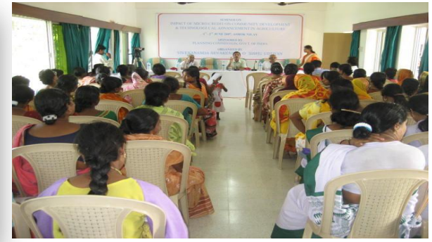
Business Dev training for entrepreneurs