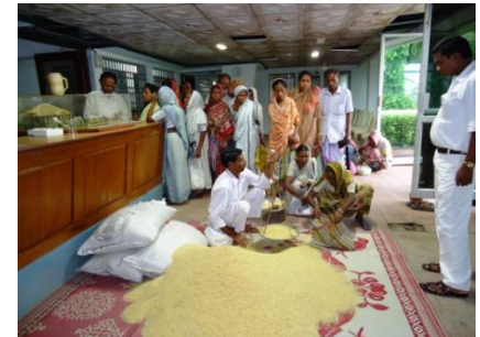
Distribution of Rice & pulse