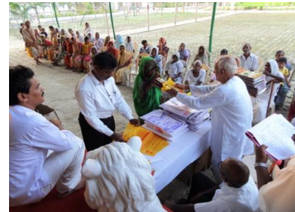
Monthly -Relief programmes