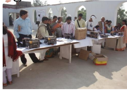
Renewable Energy Centre