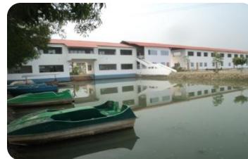
Residential Campus for Students