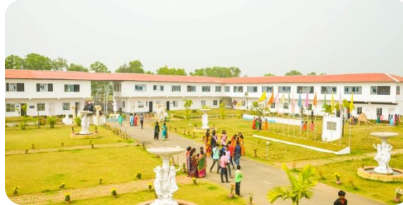
Ashok Nilay Institute of Nursing