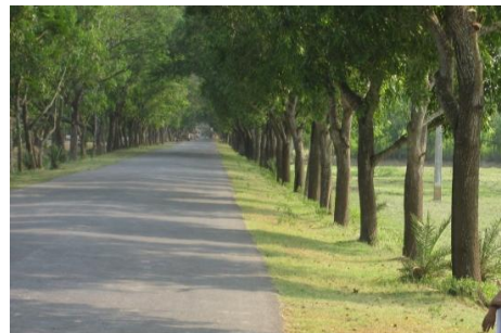
140 km Roadside (#800,000) Tree & mangrove Plantation